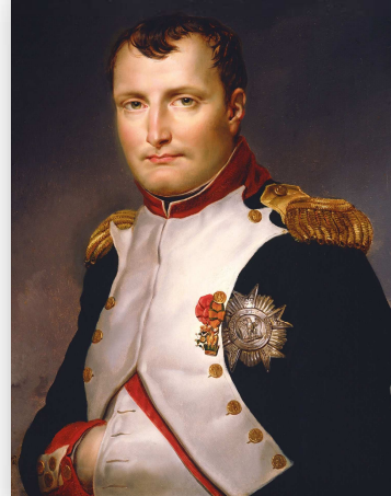
Napoleon Bonaparte, circa 1813

would do the following day. Should they organize a defense of their town? The carnage would be great as untrained citizens tried to withstand against the greatest army in the world. Should they simply display the white flag of surrender and allow the enemy to march into their community unopposed? This would save lives and probably spare their community, but at the cost of occupation by a hostile force.