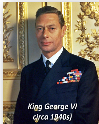
King George VI circa 1940s)

For some, the New Year offers uncertainty, particularly when times are tough, or the pundits give us a less than optimistic outlook for the future. I well remember twenty years ago when, with much trepidation, we were all entering not only a new decade, but a new millennium. Y2K was that watch word and even with months of preparation, many wondered if computers would work, if our financial system would be crippled or if even the simplest items would be rendered useless. So, we all braced for the future as best we could. Some stored-up supplies, others withdrew cash from the bank, and some stayed at home fearing the worst. The Y2K fears soon fizzled, but these past two decades have had challenges of their own that continue to test our resolve. Terrorism came to our shores on September 11, 2001, and soon after, we went to war. We've seen almost two decades of war with many of our best and brightest leaving