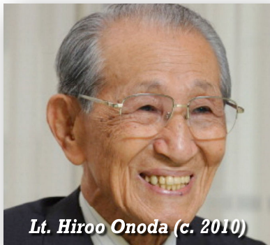
Lt. Hiroo Onoda (c. 2010)

Near the end of 1945, a B-17 dropped leaflets across remote parts of the island printed with the surrender order signed by General Yamashita of the Fourteenth Area Army. Still, the wording on the leaflet seemed suspicious and Lt. Onoda considered it to be an Allied hoax. In the following months, many more leaflets were dropped; newspapers were left; photographs and letters from relatives were dropped; friends and relatives spoke over loudspeakers. In every instance, something seemed suspicious and Onoda and his men remained vigilant. In the coming years, Lt. Onoda and his men got into clashes with Filipino villagers and soldiers, often while searching for food. After each encounter, search parties of soldiers or police would come looking for them. This further solidified in Onoda's mind that the war was still going on.