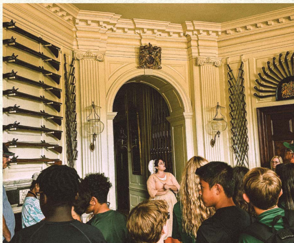
8th graders step back in time, captivated by history at Colonial Williamsburg.

as well as go aboard the historic Battleship North Carolina, where they explored the decks and learned about life at sea during wartime. The eighth graders wrapped up the middle school trips with a journey to Colonial Williamsburg, stepping back in time to the days of early America. Walking through cobblestone streets, visiting colonial homes, and interacting with reenactors brought history to life like never before!