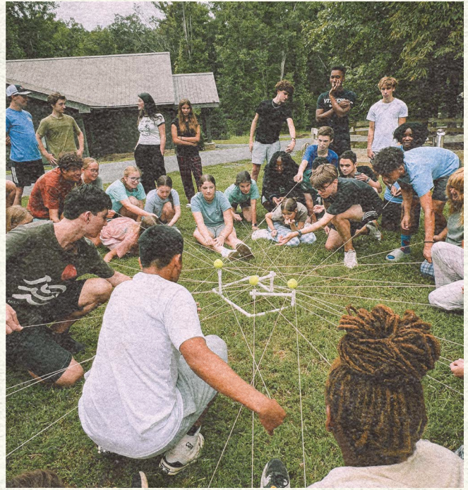
Freshmen and seniors bond and make memories together at their Anchorage retreat.

The memories made, lessons learned, and friendships strengthened will be cherished by our Falcons for years to come. A big thank you to everyone who helped make these experiences possible!