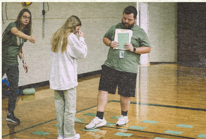
House Forte figuring out their gameplan.

cheering for their peers or taking part in the games themselves, students are fully embracing the spirit of friendly competition. Each House is ready to push even harder in the upcoming events, aiming to climb the ranks and claim victory. Stay tuned for more updates as the competition progresses!