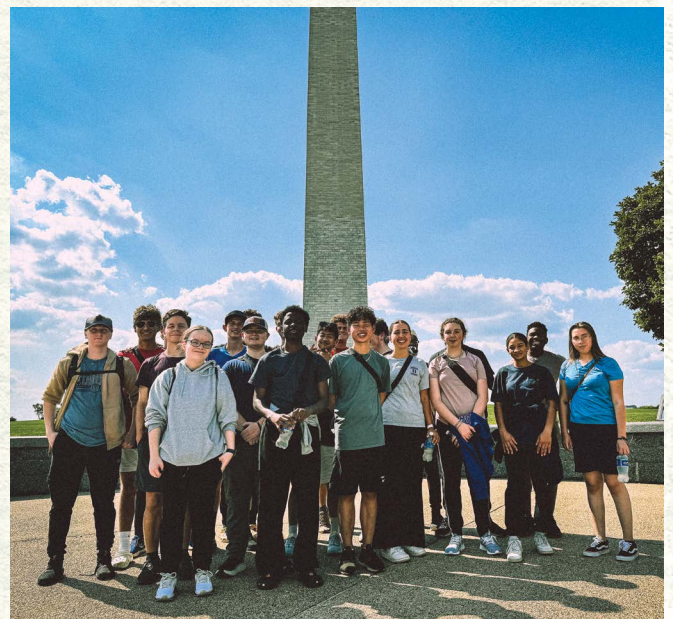
The junior class stands tall at the Washington Monument, soaking in the history of D.C.