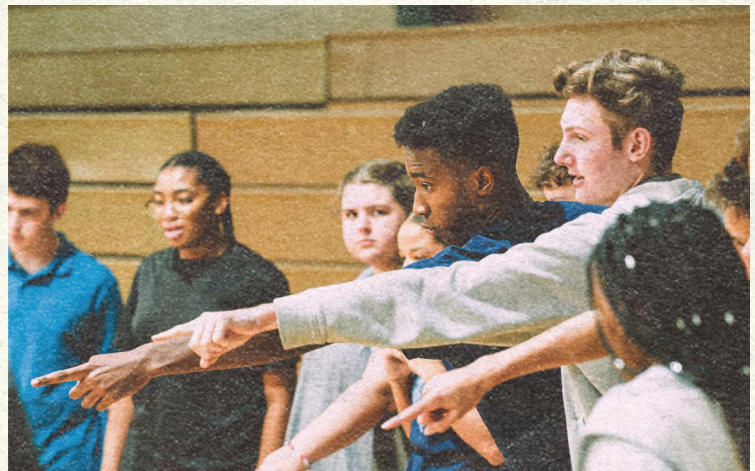
House Akili trying to help their team claim the victory.