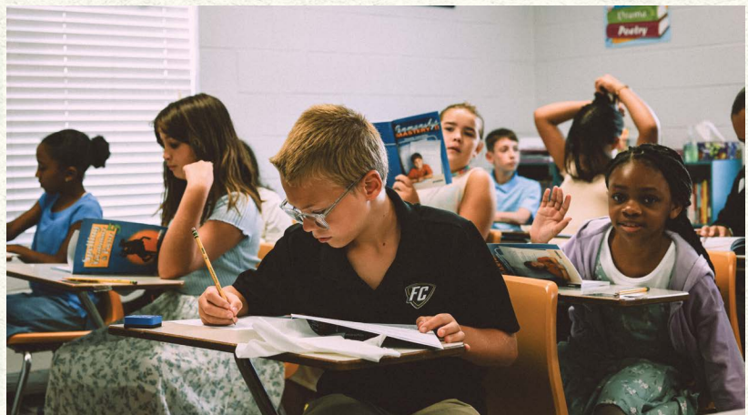
Focused and hard at work, 5th graders dive into their lessons with determination.